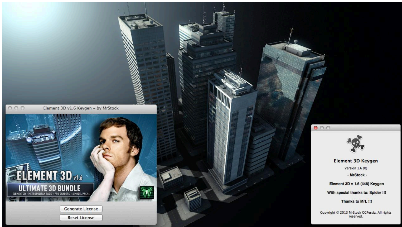
Element 3d Metropolitan Keygen